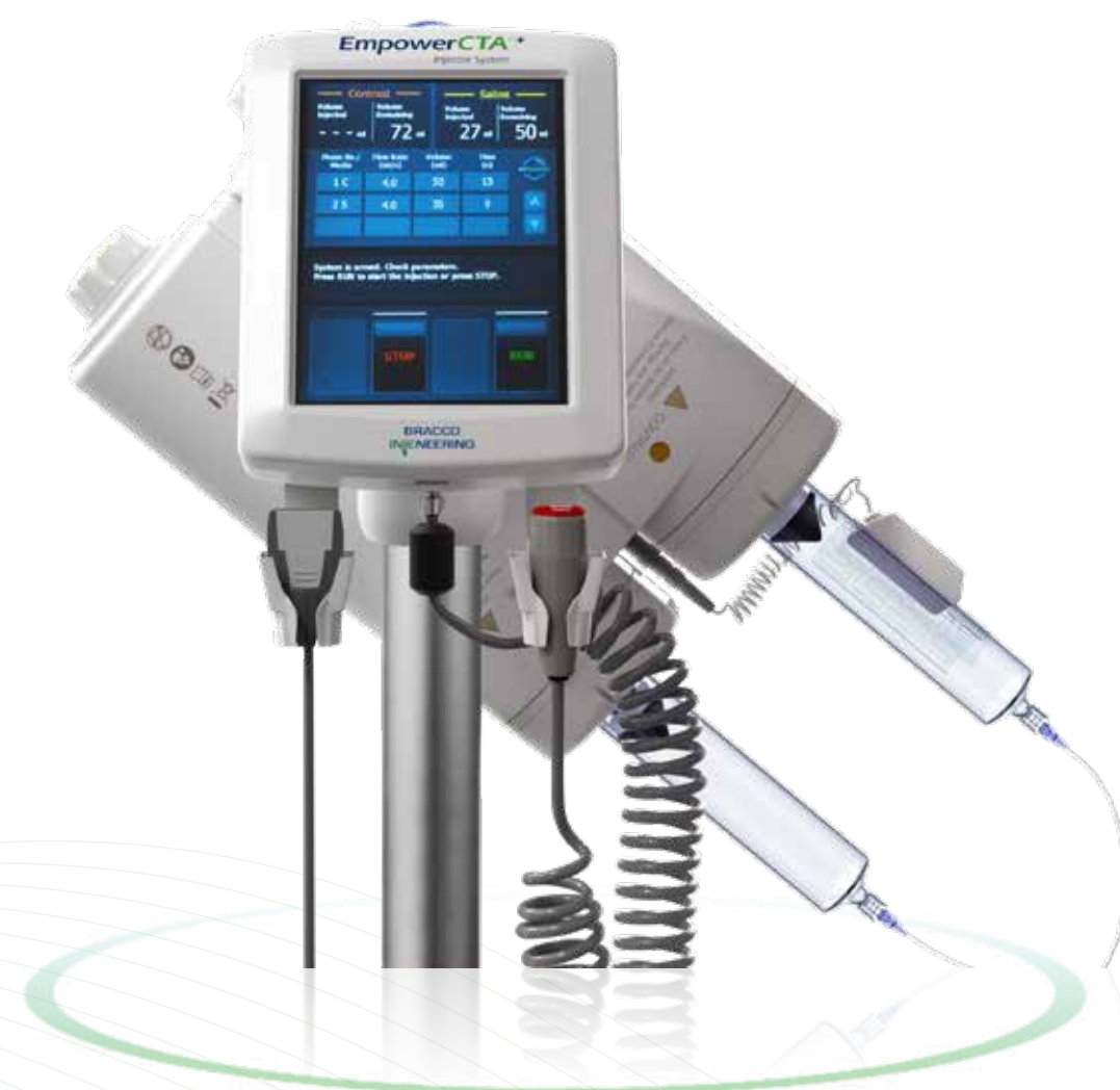
EmpowerCTA ® + Injector System

Providing peace of mind so you can focus on patient care