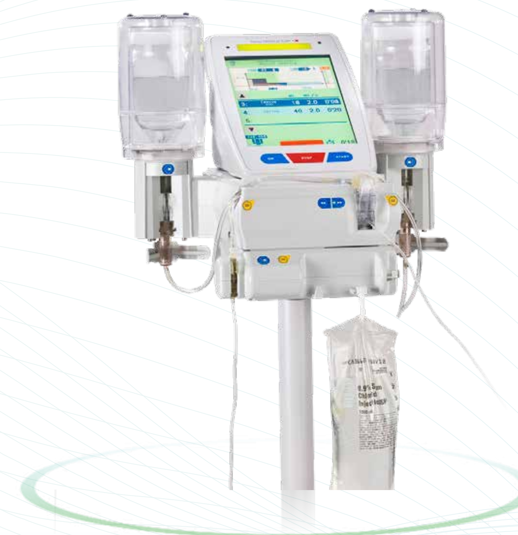
CT Expres ® Contrast Media Delivery System