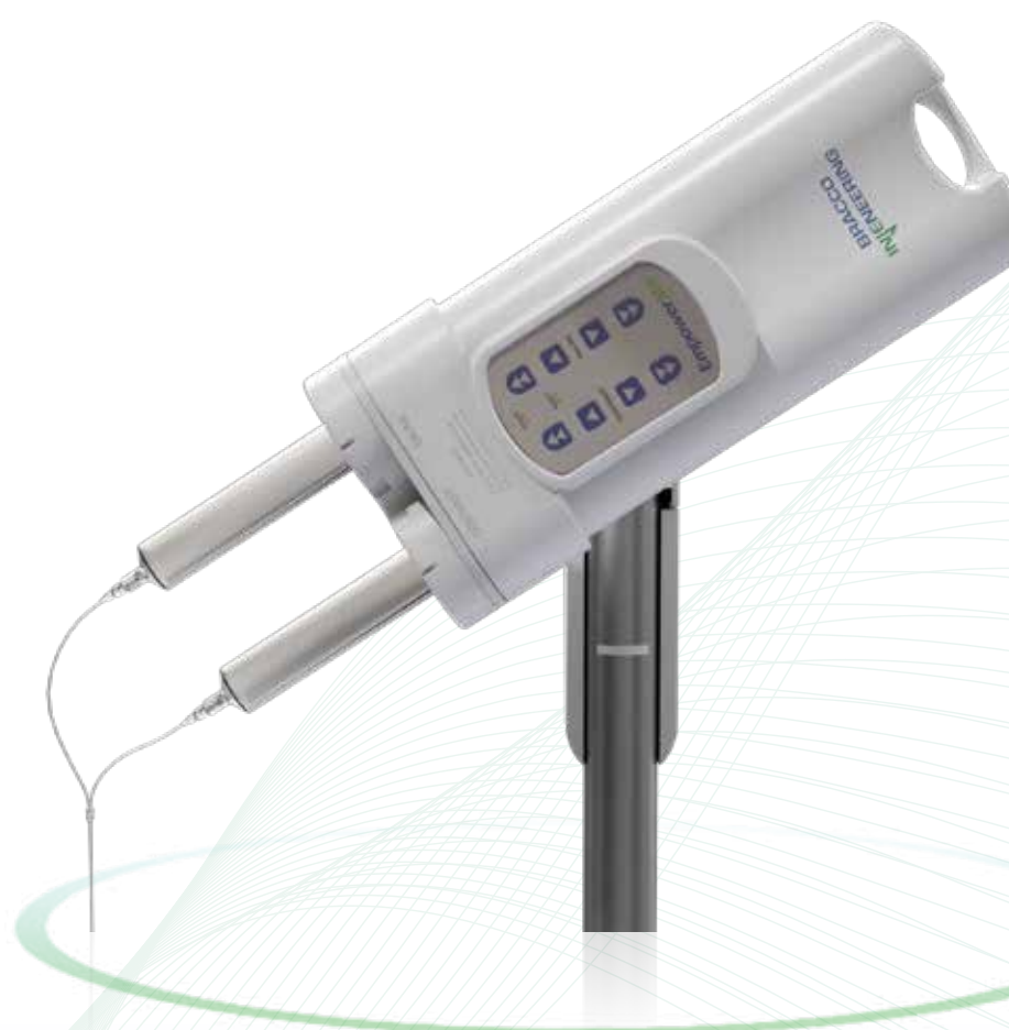
EmpowerMR ® Injector System