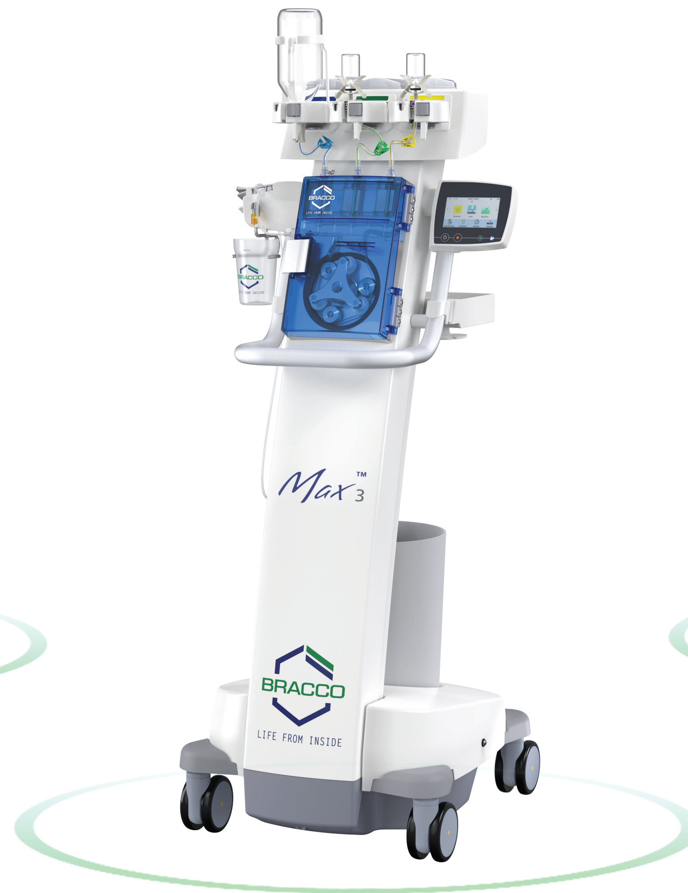
Max TM 3