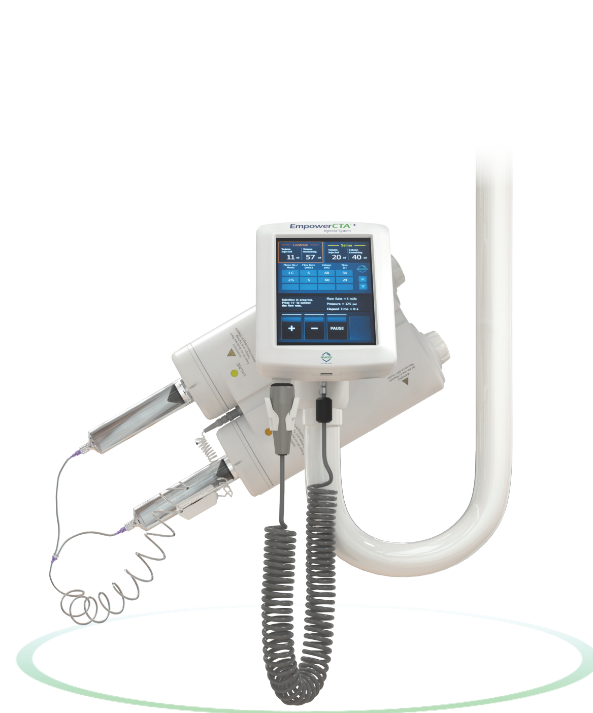
EmpowerCTA ® + Injector System